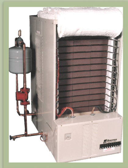
ETS Furnace (cutaway view)

Please note that this schedule will vary and times and dates are approximate.